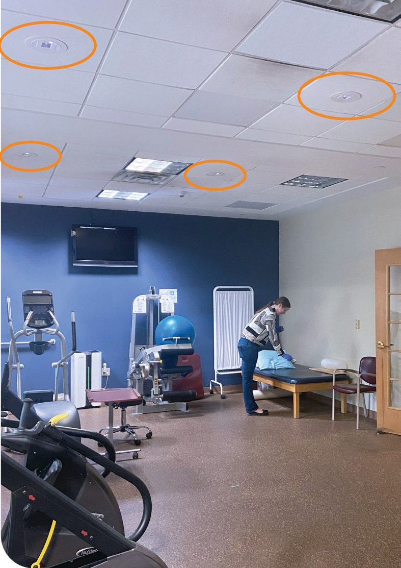
Comparable in size to a traditional canned light, Visium fixtures are inconspicuous. Each unit produces < 1 lumen of visible light and operates without any noise - providing all the benefit without any distraction.

Results showed that Visium reduced the bacterial abundance on high touch surfaces in the PT room by an average reduction of 62%. In the dining room, bacterial abundance reduced by an average was 72%.