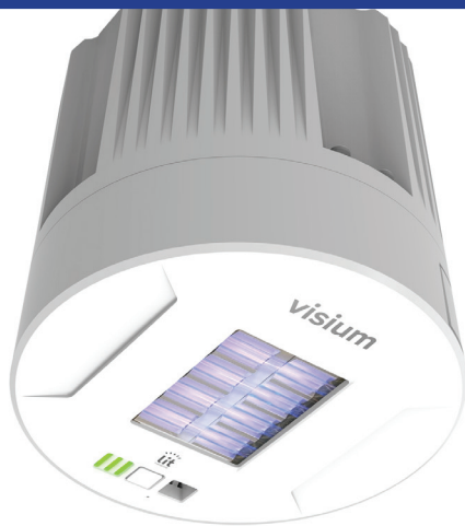
Visium Far-UVC light fixture with clear Ushio Care222 Kr-Cl Excimer Lamp Module.